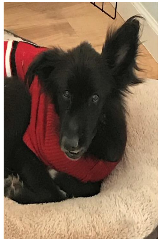
Promise – heart worm treatment