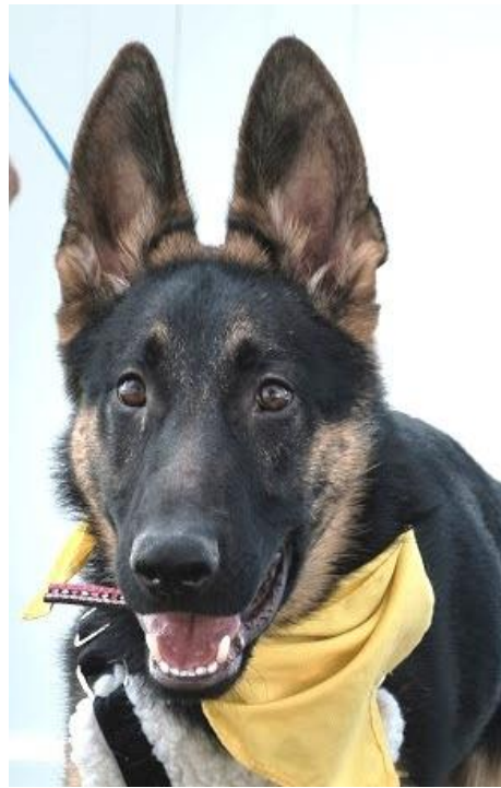
Kadin – elbow dysplasia surgery