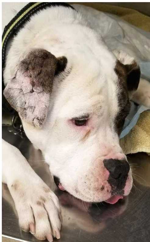
Biggie – ear hematoma surgery