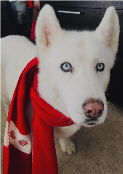
Dory – physical therapy