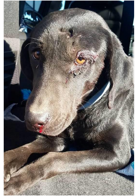
Clarence – hit by car (x-rays)